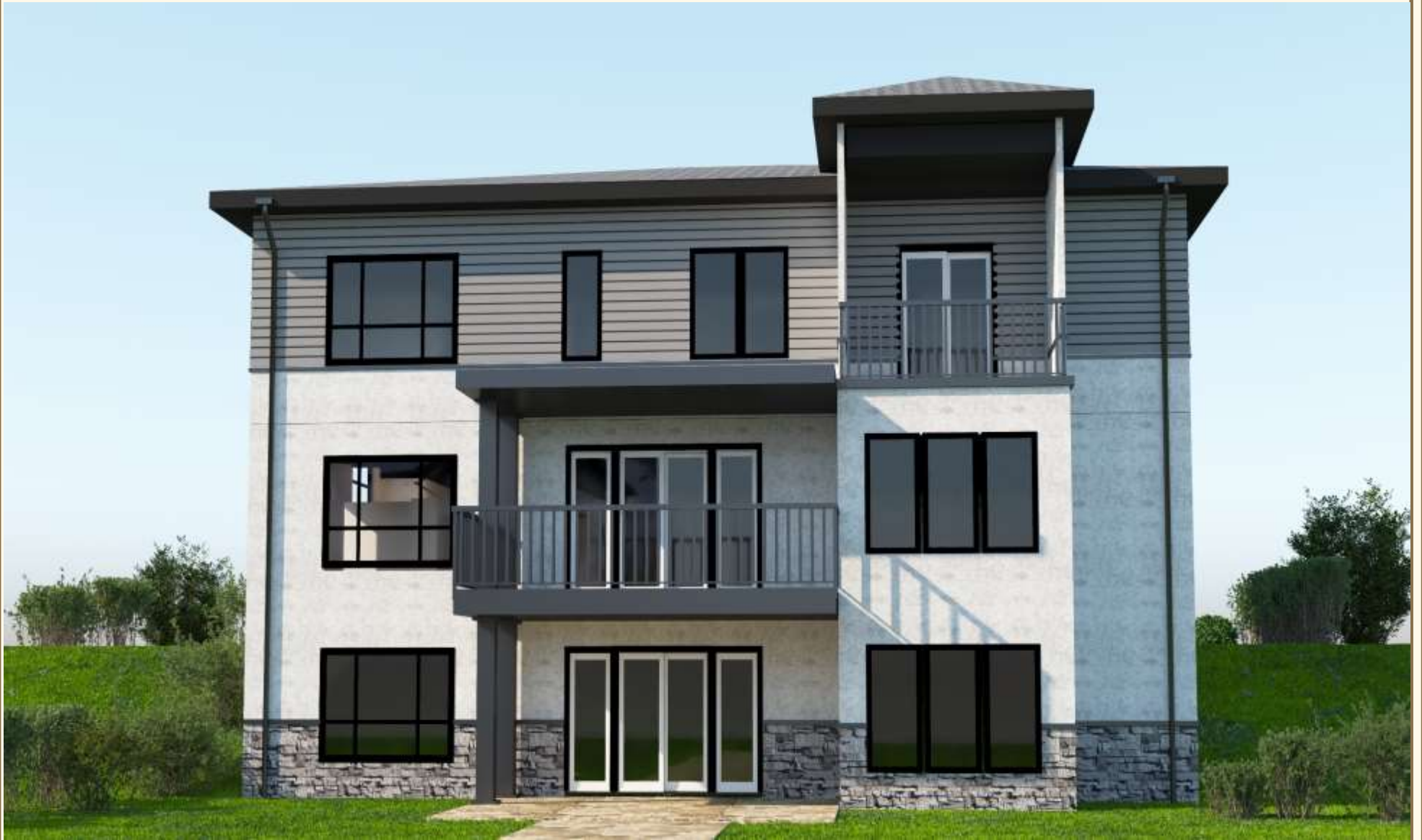
Rear Elevation, Opt. Walk-Out (Lot dependent)