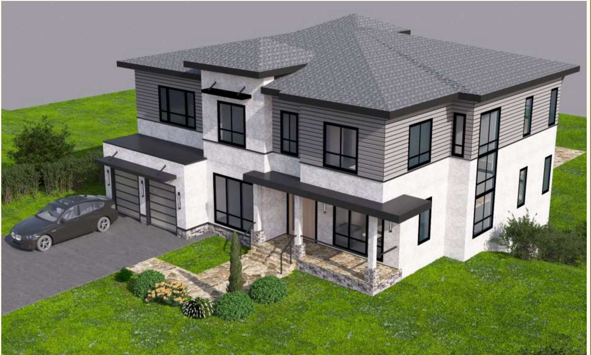
The New Krakow Model